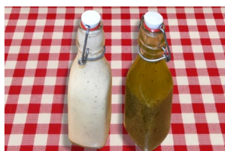
Home-made salad dressing