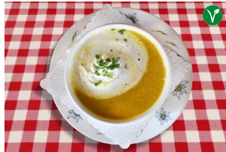
Pumpkin cream soup (7,9,16)