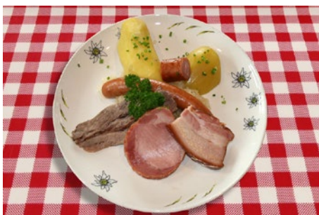
Bernese platter (3,7) (boiled beef (9) , bacon, smoked sausage and kassler (cured mildly smoked pork) ) served with sauer- kraut and boiled potatoes