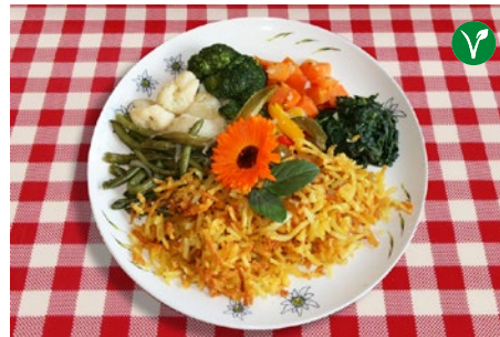
Hash browns with mixed vegetables (16)