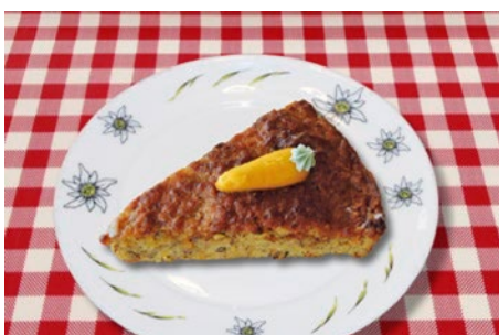
Homemade Carrot Cake (1,3,7,8)