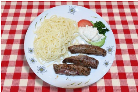
Lamb fillet (3,10) with garlic mayonnaise