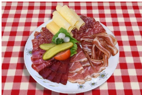
Mixed plate of cold meat and cheese à la „Stägerstübli“ (7)