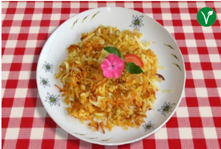
Plain hash browns (7)