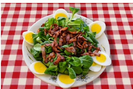
Lamb's lettuce with hard-boiled egg and bacon (3)