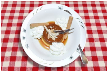
Caramel flan (1,3,6,7,8) with whipped cream