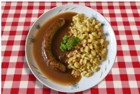
Pork sausage (1,6,9) with an onion sauce