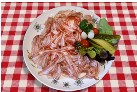
Swiss air-dried bacon from the Bernese Oberland