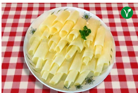
Wafer thin slices of Swiss moun- tain cheese (7) from the alp Schilt