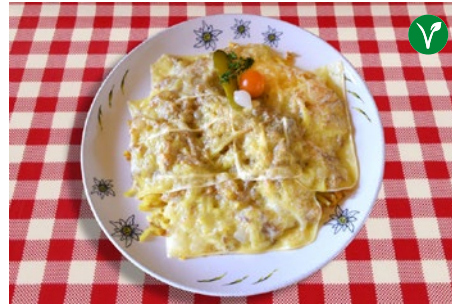
Hash browns topped with melted cheese (7)