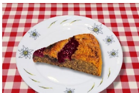
Homemade Linzer Cake (1,3,7,8)