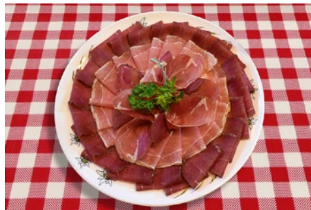
Plate of dried meat from the Bernese Oberland (beef / pork)