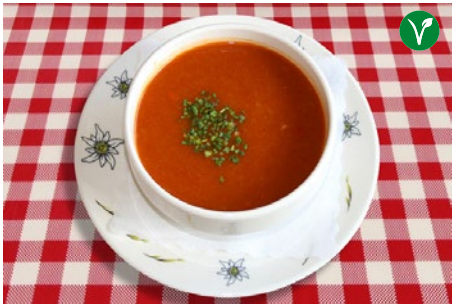
Tomato cream soup (9,16)