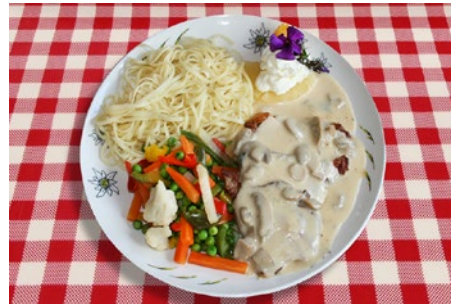
Escalope of pork (1,6,8,9,16) with a mushroom cream sauce