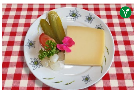
Portion of cheese (7) from the alp Sefinen