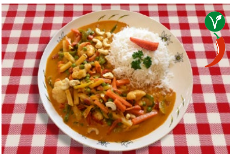
Red Thai-Curry with vegetables (2,4,8,16)

jasmine rice (glutinous) and cashew nuts