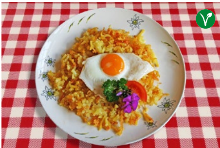
Hash browns with a fried egg (3,7)