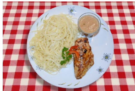
Breast of Swiss chicken (15) with pepper sauce (1,6,7,9) or herb butter (7,10)