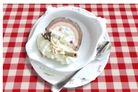
Cassata with Maraschino (7) (alcoholic) and whipped cream CHF 9.50