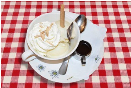
Coupe Denmark (3,6,7,8) Vanilla ice cream with chocolate sauce and cream CHF 13.00 Mini CHF 10.00