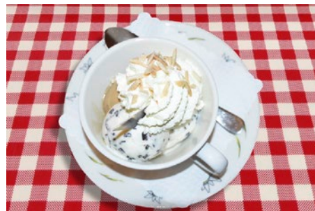
Coupe Stracciatella (3,6,7,8) Café- & Stracciatella ice cream with cream CHF 13.00 Mini CHF 10.00