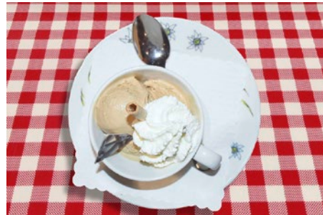
Ice Café (6,7,8) Café ice cream with cream CHF 13.00 Mini CHF 10.00