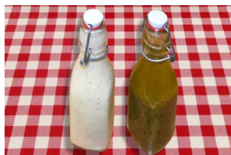
Home-made salad dressing