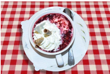
Coupe Hot Berry (3,6,7,8) Vanilla ice cream with hot wild berries and cream CHF 13.00 Mini CHF 10.00