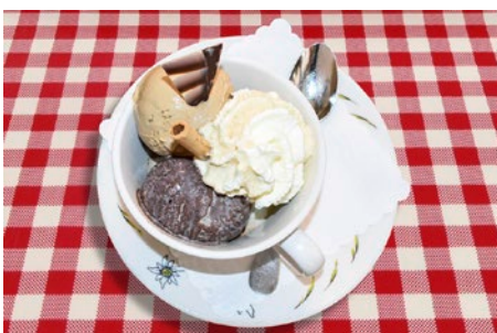
Coupe Baileys (3,6,7,8) Vanilla, café, chocolate ice cream with Baileys (alcoholic) and whipped cream CHF 14.00 Mini CHF 11.00