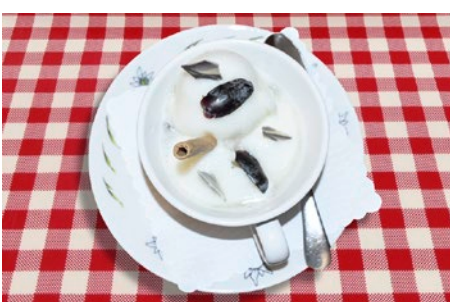
Pear sorbet (3,6,7,8) Sorbet pears with Williams (alcoholic) CHF 14.00 Mini CHF 11.00