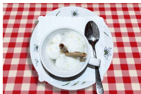
Coupe Le Colonel (6,8) Sorbet lemons with Vodka (alcoholic) CHF 14.00 Mini CHF 11.00