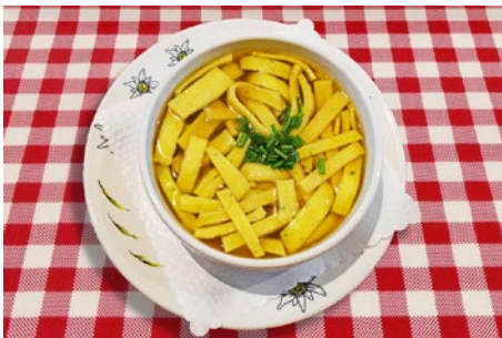
Beef clear soup (3,7,9,16) with homemade pancake stripes